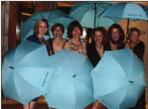
Friends of the Foundation enjoy a festive evening at Tiffany and Company.

Tiffany & Co at La Encantada in Tucson, AZ was the enchanting location for a festive evening of tasting, toasting and shopping!