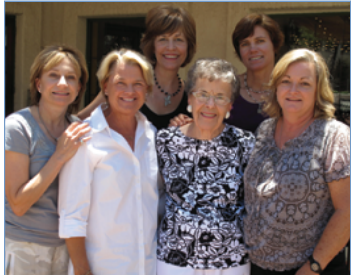
A very special group that are part of the Foundation’s heart and soul in Tucson, AZ