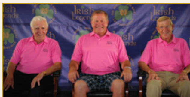
Coaches Parseghian, Kelly and Holtz enjoying the Irish Legends event