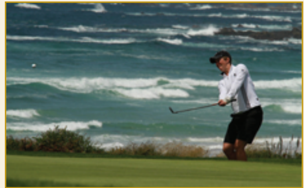
Splendor on the links at Pebble Beach